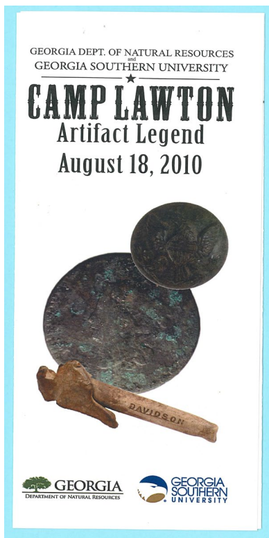
Brochure for Camp Lawton

During the Civil War, the area now encompassed by the park, was known as Camp Lawton. A stockade held Union soldiers captured as prisoners of war. The site was selected due to the abundant water supply. Between August and November 1864, Camp Lawton was planned, built, operated, and eventually abandoned. Despite its brief tenure, the prison held over 10,000 soldiers and was said to be the largest prison in the world at the time. The stockade was closed in November 1864, and its prisoners routed to other camps as General William T. Sherman's army closed in during his infamous "March to the Sea." In 2010, archaeology teams from nearby Georgia Southern University uncovered parts of the stockade wall and artifacts from prisoners. Several of these artifacts are interpreted at the Magnolia Springs History Center located inside the park. Presently, archaeologists and historians continue to study this historic property to uncover more details about the camp and its occupants.