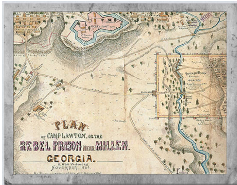
Plan of Camp Lawton Prison, 1864

After the Civil War, The springs became a popular recreation destination long before the park was established. This area was used for picnics, church gatherings, reunions, and swimming for local citizens. These same citizens pushed for the development of the area for years until the park was officially created in 1939. Like many early Georgia state parks, much of the infrastructure of Magnolia Springs was built by the Civilian Conservation Corps, also known as the "CCC." The CCC was responsible