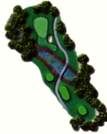
Hole 2 Par 3 Yardage 196

This converted par four provides a test to start the round. Keep the tee shot left of the fairway bunkers to set up your approach to the elevated green.