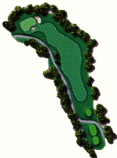
Hole 5 Par 4 Yardage 355

This par three requires precision as the green falls off on the left side.