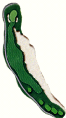
Hole 14 Par 4 Yardage 442

A long uphill par four, keep all tee shots to the middle or middle left on the fairway area.