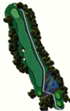
Hole 6 Par 4 Yardage 411

This is a risk and reward hole. A good tee shot down the left side will leave a short approach.