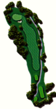
Hole 8 Par 4 Yardage 331

Watch out for the hazard that runs the length of the hole and extends out into the fairway in the landing area.