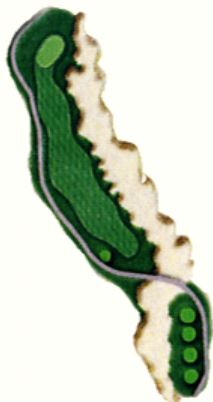
Hole 10 Par 4 Yardage 446

This is the first of the new holes. This par 4 plays uphill with a large waste area on the right that should be avoided at all costs.