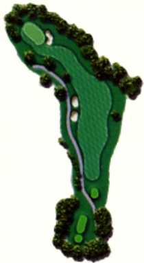
Hole 9 Par 4 Yardage 373

Keep the tee shot right to avoid the heavy trees and leave the best approach. The bunker in front of the green was minimized in the re-design.