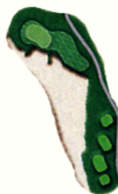
Hole 15 Par 3 Yardage 227

Keep the tee shot right of the 150 yard marker to get the best view of this green. If the hole is cut on the right side, play to the middle.