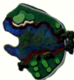
Hole 17 Par 3 Yardage 200

The tee shot should be played at the tower in the distance with a second shot played short of the fairway bunker for best results.