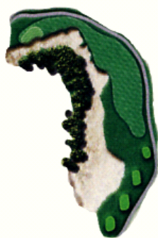
Hole 16 Par 4 Yardage 412

The par three signature hole plays downhill over the hazard to a shallow green. There is a drop area at the forward tees for those who are unsuccessful.