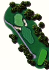
Hole 4 Par 3 Yardage 158

A tee shot down the left side of the fairway will generally bounce down to the middle, leaving a fairly nice approach to the elevated green.