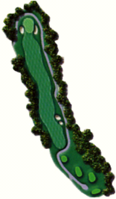
Hole 1 Par 4 Yardage 442

This converted par four provides a test to start the round. Keep the tee shot left of the fairway bunkers to set up your approach to the elevated green.