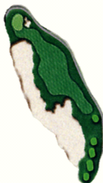
Hole 13 Par 4 Yardage 417

Keep the tee shot left of the waste area to leave a long approach to a downhill green.