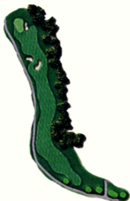
Hole 18 Par 5 Yardage 570

It is better to be long on this hole than short. Be sure to check the wind direction on this hole before teeing off.