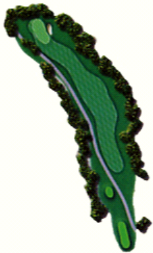
Hole 3 Par 4 Yardage 404

The play here is to the right side of the green. The left side of the green falls off into the hazard.