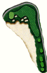
Hole 11 Par 4 Yardage 347

This is the first of the new holes. This par 4 plays uphill with a large waste area on the right that should be avoided at all costs.