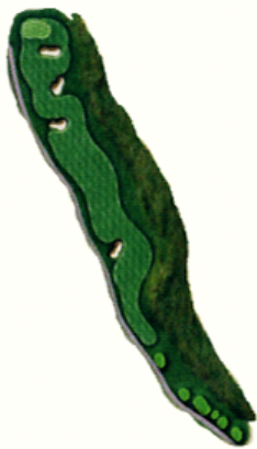
Hole 12 Par 5 Yardage 556

Keep the tee shot left of the waste area to leave a long approach to a downhill green.