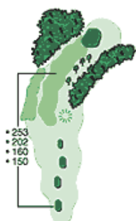
Hole 1 Par 4 Yardage 375

Hit the ball down the left side to avoid trouble and leave an open shot to the green.