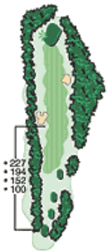
Hole 10 Par 4 Yardage 427

The opening tee shot of the back side needs to be to the right. The approach to the green should not come up short right, as that is the most difficult place to get it up and down.