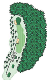
Hole 5 Par 4 Yardage 321

Play your tee shot slightly to the left. Don't go too far as the waste area is not a bad place to play from.