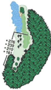
Hole 8 Par 5 Yardage 476

This is a short hole that can be difficult. Some players can reach the green off the tee. Even so, an errant tee shot can cause lots of trouble. The smart shot is to lay up off the tee.