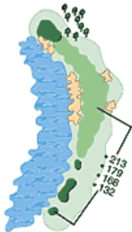
Hole 18 Par 4 Yardage 415

Avoid the bunker at all costs. Also, don't hit the ball over the green.