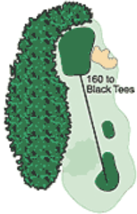
Hole 16 Par 4 Yardage 325

This tee shot needs to be placed left of the waste area.