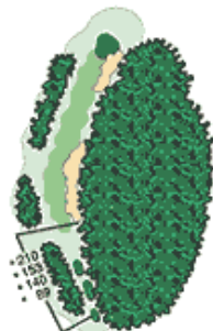
Hole 4 Par 5 Yardage 564

Keep the ball to the right on this hole. The best place to miss is short right.