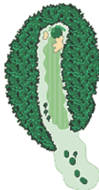
Hole 11 Par 5 Yardage 486

The opening tee shot of the back side needs to be to the right. The approach to the green should not come up short right, as that is the most difficult place to get it up and down.