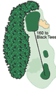
Hole 17 Par 3 Yardage 175

Play your tee shot to the right side to avoid the waste area. The driver may not be the club of choice on this hole. If you can hit it far enough, you may be able to drive the green.