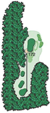
Hole 14 Par 3 Yardage 191

The tee shot for this hole should be kept to the right.