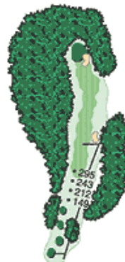
Hole 13 Par 5 Yardage 549

If you are a long hitter take a shot at the green. If not, hit a club off the tee that will leave you about 120 yards from the green.