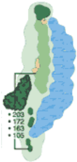
Hole 9 Par 4 Yardage 449

Keep this tee shot down the right to avoid the creek on the left. Some players will choose to go for the green in two. Be careful as that shot or laying up can be dangerous. Both are hit to a tight landing area with water down the left.