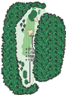
Hole 12 Par 4 Yardage 300

Hit your tee shot down the left side of the fairway to leave an open approach to the green. This par five can be reached in two.