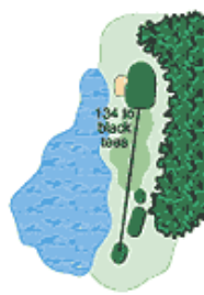
Hole 3 Par 3 Yardage 154

This hole calls for a tee shot down the left side to avoid the fairway bunkers.