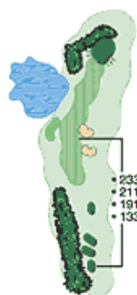
Hole 2 Par 4 Yardage 406

Hit the ball down the left side to avoid trouble and leave an open shot to the green.