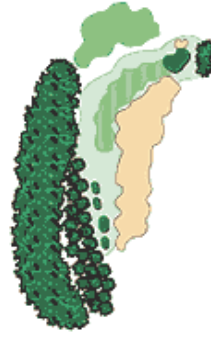
Hole 15 Par 4 Yardage 395

The tee shot for this hole should be kept to the right.