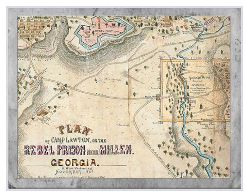
Brochure for Camp Lawton