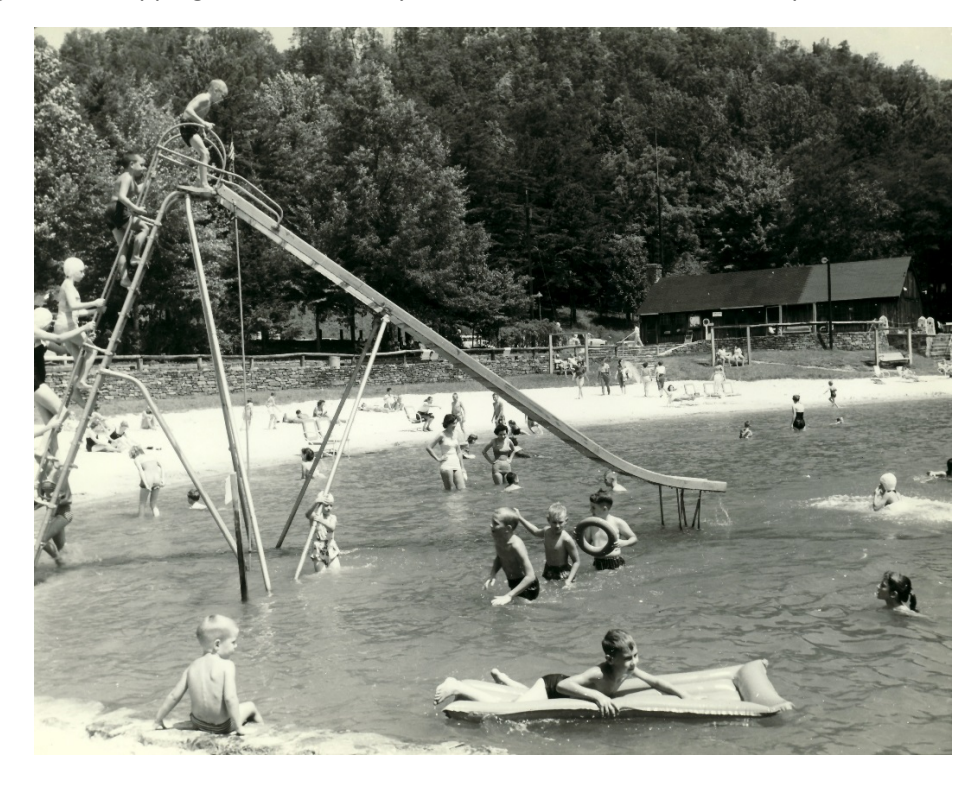
Vogel Swimmers enjoying Lake Trahlyta, ca. 1960's

In the years since the park's creation, Vogel State Park has been one of the most popular destinations for campers and hikers in the state. Today, visitors can swim, boat, and fish in Lake Trahlyta, and they can also enjoy camping and cottage stays, viewing waterfalls, hiking trails, playing miniature golf, and stepping back into history at the Civilian Conservation Corps museum.