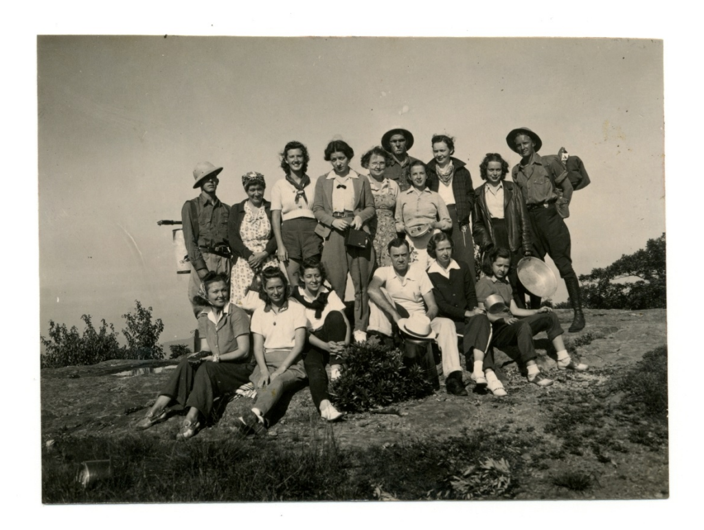
Hikers on Blood Mountain in the 1930's

Vogel State Park, established in 1931, is the second oldest state park in Georgia. Located at 2500 feet above sea level, Vogel sits at the base of Blood Mountain, the highest summit on the Appalachian Trail in Georgia, and is surrounded by Chattahoochee National Forest. The North Georgia Mountains around Vogel were linked to Native American people for generations before European settlement. They were said to be the home of the immortal spirit people known as "Nunnehi," translated as — "the people who live forever." Legend states that the names of Blood Mountain and nearby Slaughter Mountain, have their origins in warfare between competing Cherokee and Creek tribes. Another story tells of treasure placed on Blood Mountain in the days leading up to the infamous Trail of Tears, when Cherokee warriors supposedly buried tribal treasure, including weapons and gold, in a cave on Blood Mountain. Many searches have been made over the years, however, and the location of the hidden treasure, if it ever existed except in the minds of storytellers, remains a mystery. Whether these legends are based in fact, no one knows, but the influence and enduring legacy of Native American culture on the region is without question.