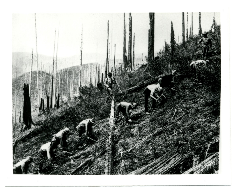
CCC Boys working at Vogel

manual labor jobs related to conservation and development of natural resources. Company 431 was responsible for building the dam on Wolf Creek, impounding the water and creating the 22 acre Lake Trahlyta. The CCC boys also built cabins, picnic areas, and campgrounds at Vogel. Other CCC companies worked around the state and developed several Georgia State Parks such as Indian Springs and Hard Labor Creek. Their impact is still felt today, and artifacts from the CCC era are on display at the park's CCC museum.