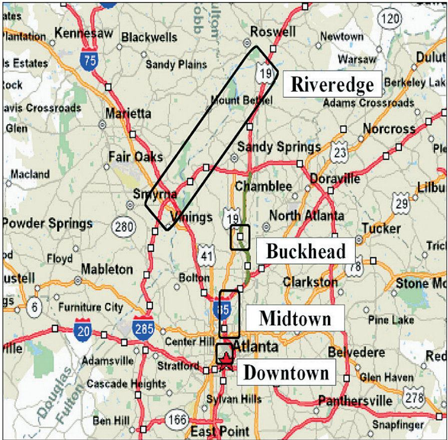
Figure 1. Study areas within the greater Atlanta metropolitan area with building locations monitored for bird strike mortalities, 2 August – 13 October 2005.