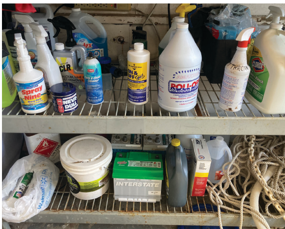
Contained Waste Storage Facility

While some marinas meet MARPOL criteria by having one dumpster in a central location, others use many small receptacles in special protective coverings and more than one dumpster. Inefficient methods include: (1) too many receptacles, which requires intensive labor for emptying; (2) receptacles too close to the water, which requires additional labor to remove trash from the water; and (3) inconvenient location of receptacles.