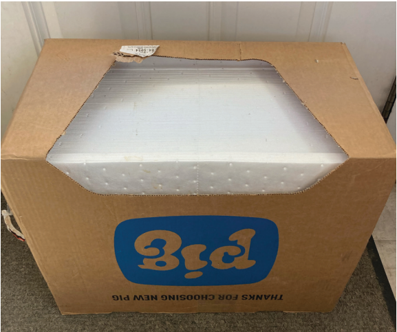
Inventory of Absorbents