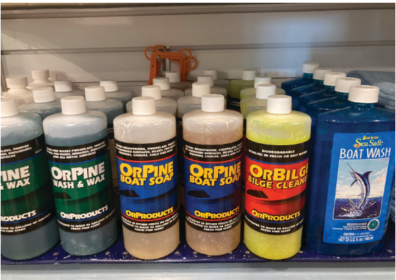
Eco Friendly Soaps