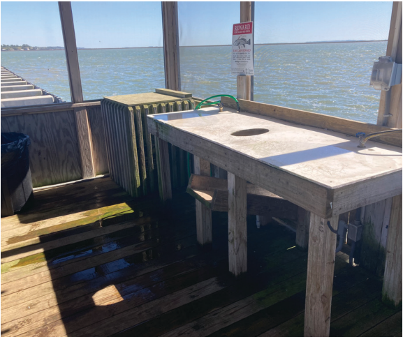
Fish Cleaning Site