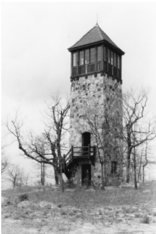
Fort Mountain Fire Tower, c. 1930s

The tower was utilized for the detection of fires from its completion in the 1930's until it was replaced by a newer metal tower on an adjacent peak in the 1960's. In 1971 the wooden cupola at the top of the tower burned. The remaining stone structure stood in disrepair until 2014 when the Georgia Department of Natural Resources undertook the task to restore the structure to its former glory. Over the next year, careful steps were taken not only to repair the structure but also to reconstruct its unique historical and architectural aspects. The stone tower at Fort Mountain won the 2016 Preservation Award for Excellence in Restoration from The Georgia Trust for Historic Preservation.