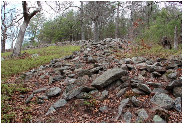
Recent photo of the stone wall ruins.

Fort Mountain State Park derives its name from an ancient stone rock edifice situated near the crest of the mountain. The rock wall zigzags along Fort Mountain for 855 feet and varies between two and six feet tall at points. Archaeological estimates state that the wall was constructed between 500 – 1500 CE. According to Cherokee lore, the wall was built by the “Moon-eyed people.” Legends tell that they were a race of people that lived in Appalachia, until they were driven out by the Cherokee. The Moon-eyed people were described by the Cherokee as being small, light skinned people, who saw better during the night than the day. The many theories of who the Moon-eyed people were, if they existed at all, help to lend an air of mystery to the ancient stones. The wall’s purpose has also been debated by archaeologists and historians, with theories ranging from a military defense fortification to a spiritual structure. The true purpose of the Fort Mountain rock wall remains an enigma to this day.