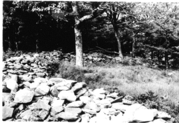
Black & white photo of wall, 1972.