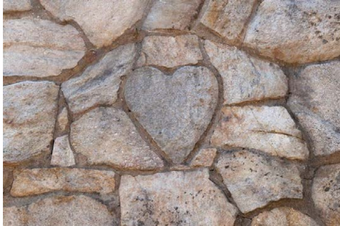
Close-up of the stone heart by Arnold Bailey, c. 1935.

The tower was utilized for the detection of fires from its completion in the 1930's until it was replaced by a newer metal tower on an adjacent peak in the 1960's. In 1971 the wooden cupola at the top of the tower burned. The remaining stone structure stood in disrepair until 2014 when the Georgia Department of Natural Resources undertook the task to restore the structure to its former glory. Over the next year, careful steps were taken not only to repair the structure but also to reconstruct its unique historical and architectural aspects. The stone tower at Fort Mountain won the 2016 Preservation Award for Excellence in Restoration from The Georgia Trust for Historic Preservation.