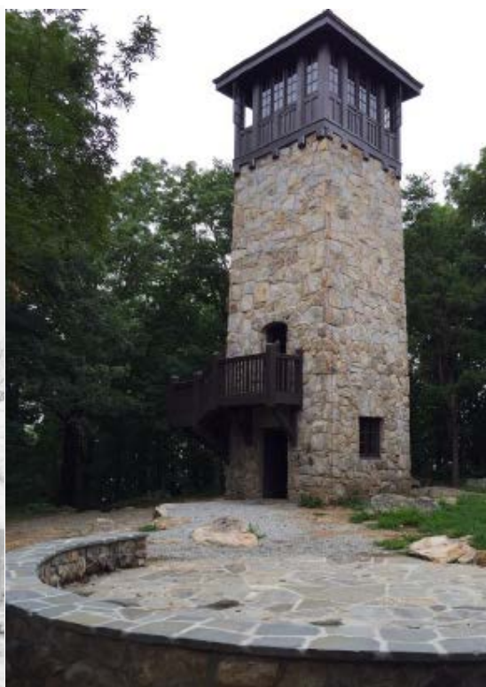
Restored fire tower with seating area, 2016.