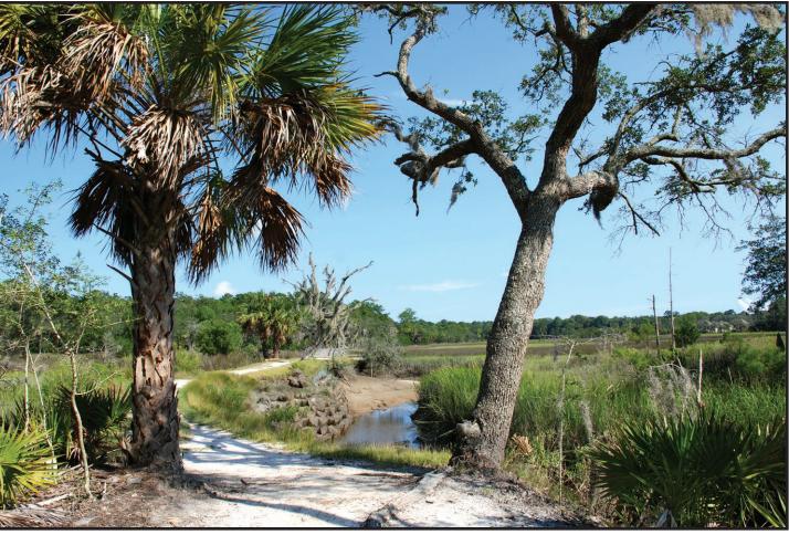
Scene on the Avian Loop Trail.

This one-mile loop takes you to the intracoastal waterway where you may catch a glimpse of osprey hunting for fish or dolphin swimming down river. A sandy causeway crosses the largest tidal creek that flows into the park. This is a great place to see the force and speed of tides flowing in and out of the marsh every six hours. Hanging from the trees is Spanish Moss, an epiphyte once used to stuff mattresses. Look but don't touch because red bugs (or chiggers) reside in this enchanting plant. That's why some Georgians still say, "Sleep tight; don't let the bed bugs bite!"