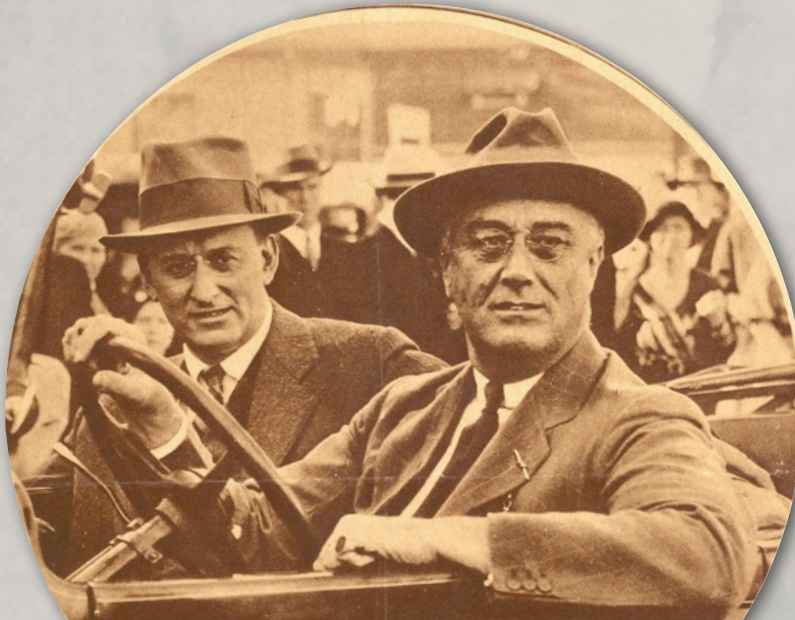
President Roosevelt and Treasury Secretary Morgenthau in Warm Springs.

Undelivered Address Prepared for Jefferson Day. - April 13, 1945