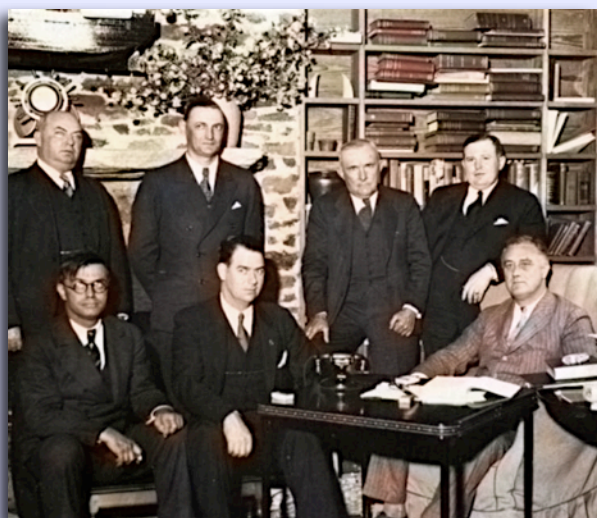
FDR creates the Southern Governors Assoc., consolidating the southern vote into a political force.