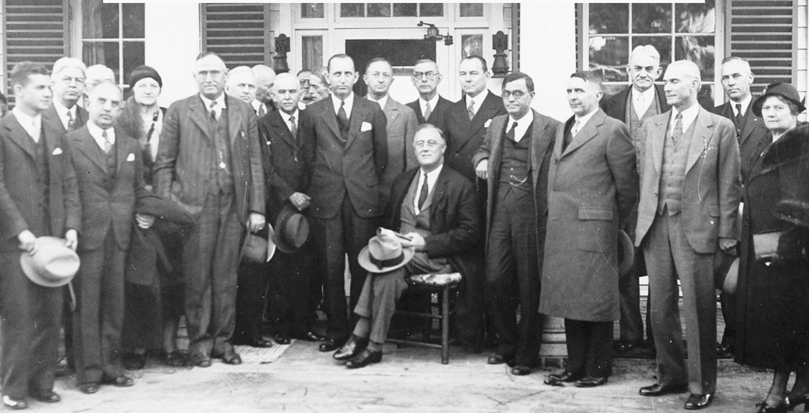
The Governor, senators and officials from the state of Georgia meet with the President to discuss issues of local interests at the Little White House.

Below are just a very few snapshots of FDR at work while in Warm Springs.